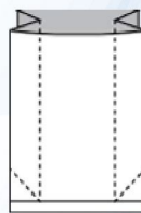
Non-Entrapment Seal, K-Seal or V-Seal Bags